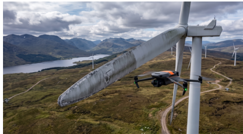
Wind Power Inspection