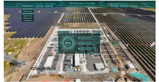
Intelligent Management Platform

Defect Detection: Hotspots, Corrosion, Bolts, Obstacles, Vegetation