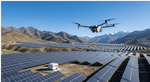
Solar PV Inspection