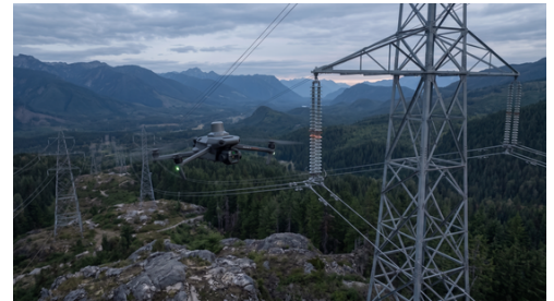
Power Line Inspection