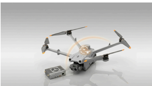
Drone + 5G Intelligent Control Module

High-bandwidth, low-latency remote command and precision control.