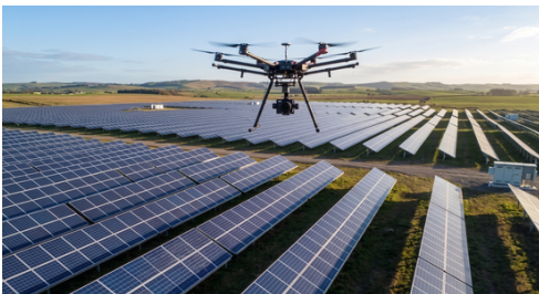
Autonomous Drone Inspection

100% Hands-free flight with zero manual intervention.