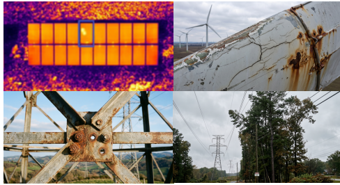
Live Video Feed & AI Recognition

100% Hands-free flight with zero manual intervention.