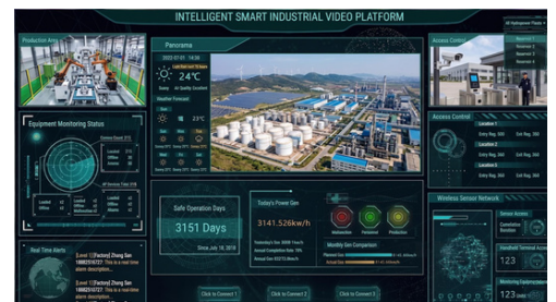
Digital O&M Platform

Automated visual analysis for rapid defect and anomaly detection.